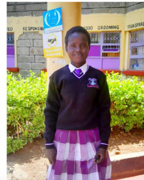
Sponsored for 2024