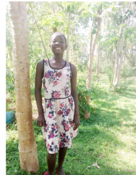
Sponsored for 2024