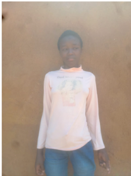
Sponsored for 2024