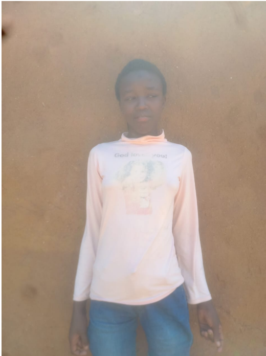
Sponsored for 2024