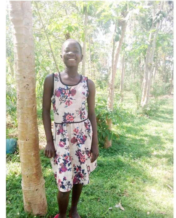
Sponsored for 2024