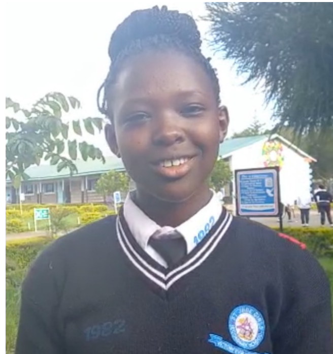
Sponsored for 2024