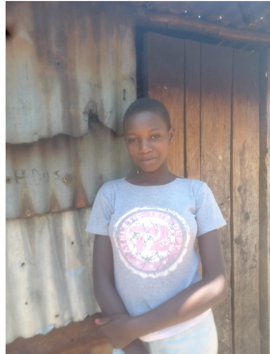
Sponsored for 2024