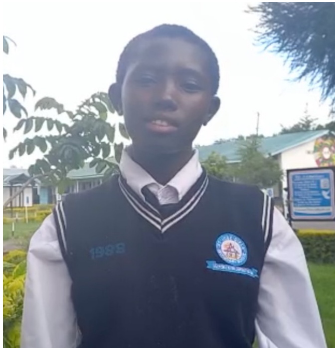
Sponsored for 2024